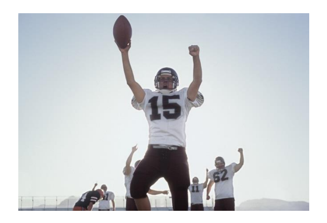
Remember, exercise will cause you to sweat. Avoid the "P-U of puberty" by using a deodorant under your arms before you get active, and shower or bathe with soap afterwards.