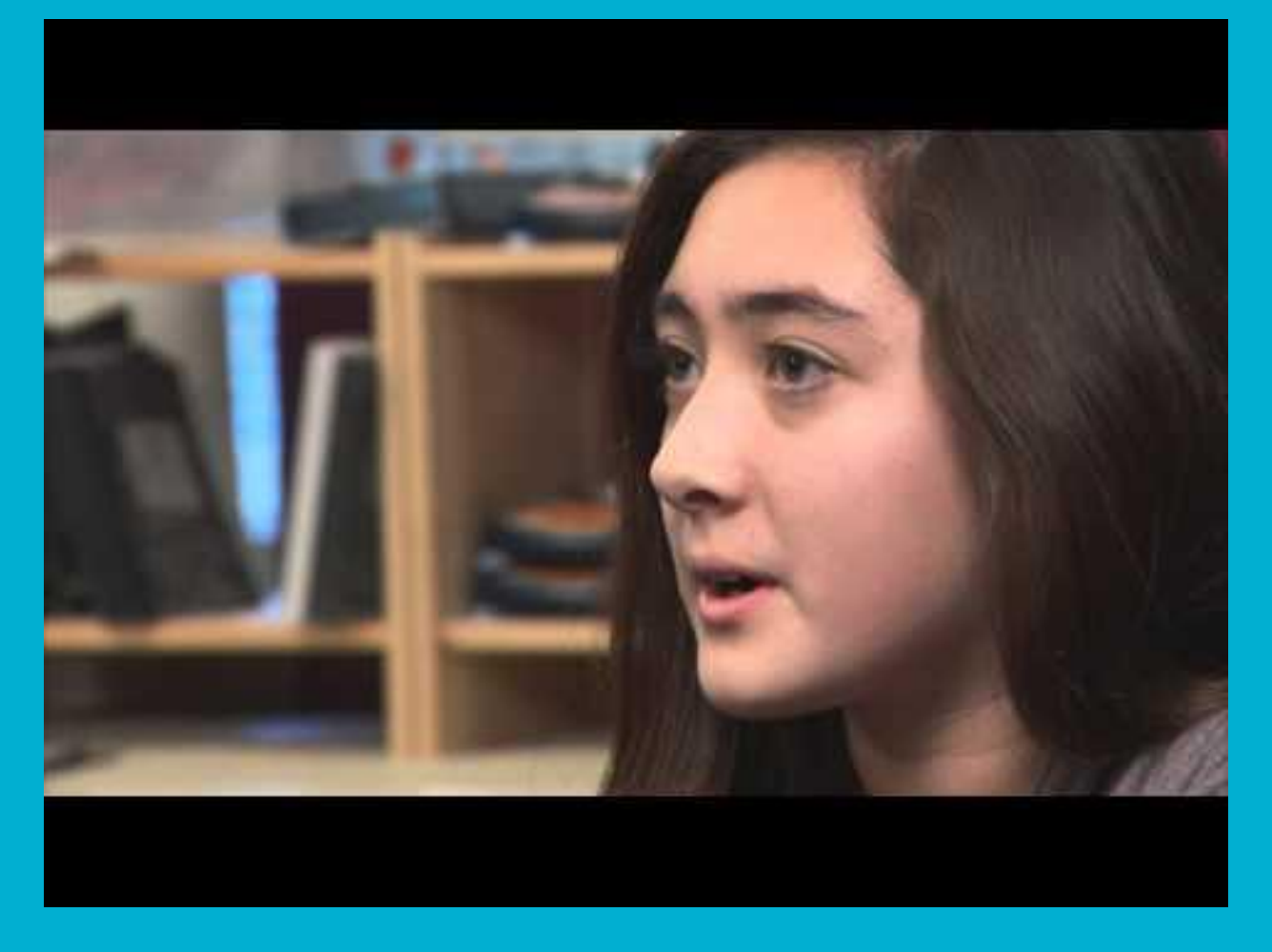
SOS Signs of Suicide Prevention Program: Student Video preview