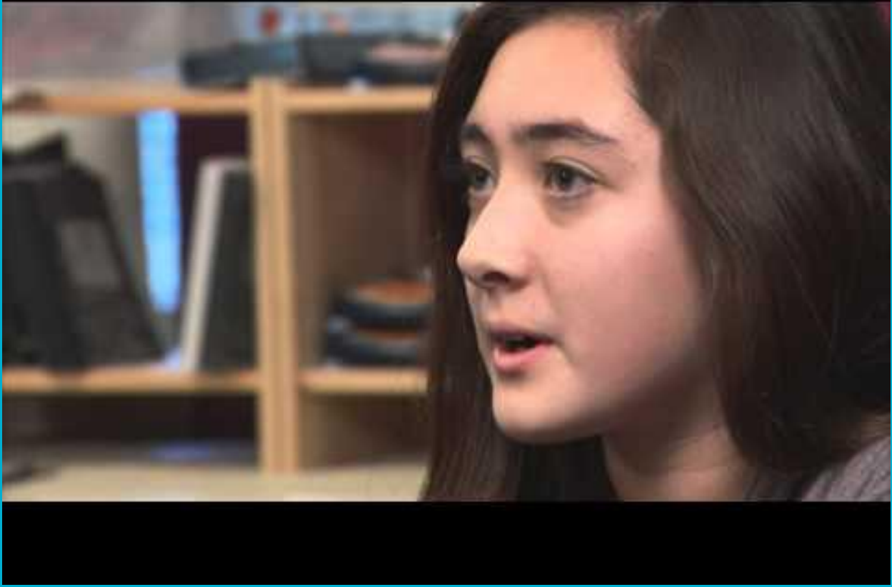
SOS Signs of Suicide Prevention Program: Student Video preview